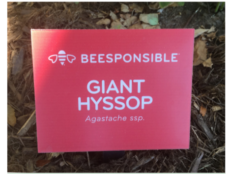
6" x 5" Spectrum Marker