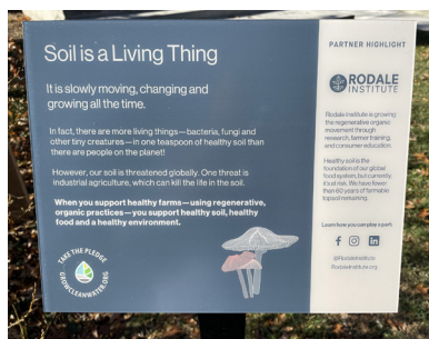
14" x 11" Spectrum Marker