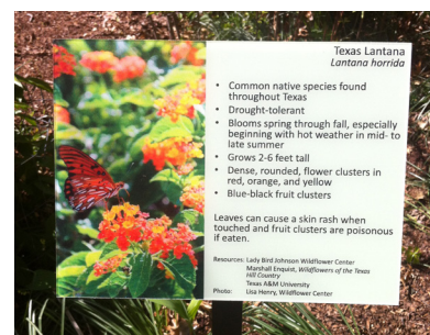
8" x 6" Spectrum Marker