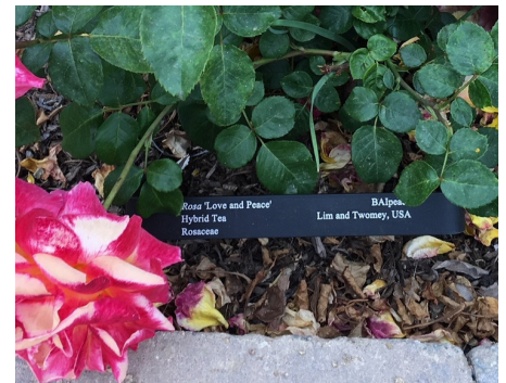
1" x 32" Double Leg Name Stake