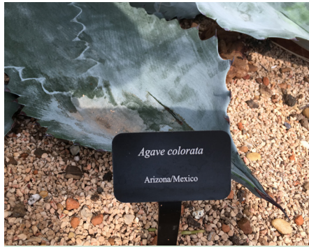
2.5" x 1.5" Classic Marker