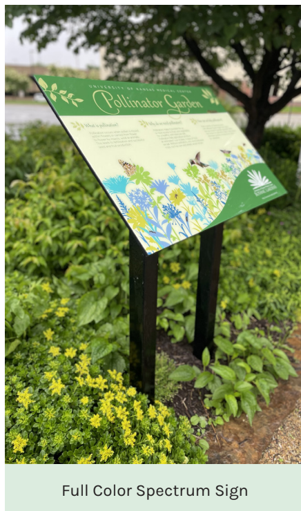
Full Color Spectrum Sign