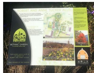
24" x 18" Spectrum Marker