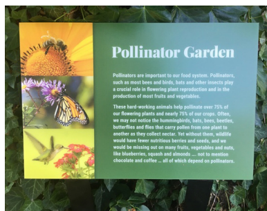
18" x 12" Spectrum Marker

Contact us at 316.682.5275 or karl@larklabel.com