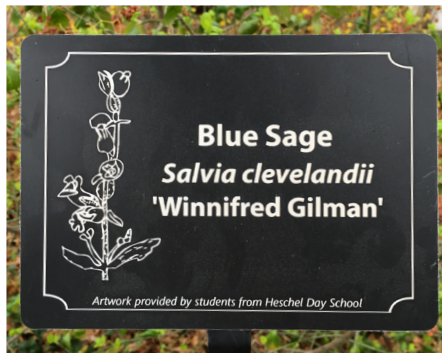
5" x 7" Classic Marker