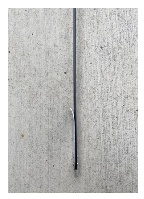
Stake Anchor ready to be installed in your garden.