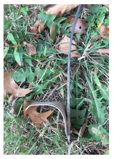
The Stake Anchor flares open to prevent removal.